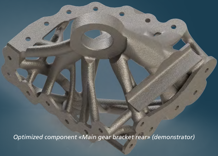
Optimized component «Main gear bracket rear» (demonstrator)