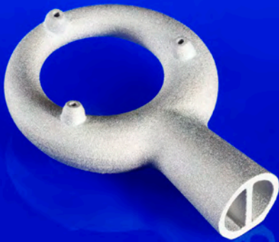
Study of a ring nozzle, status after sintering