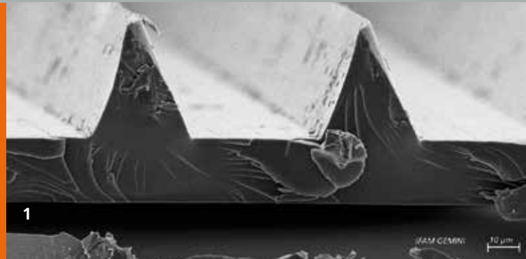
1 Scanning electron micrograph of a riblet-structured coating surface.

Fraunhofer Institute for Manufacturing Technology and Advanced Materials IFAM - Adhesive Bonding Technology and Surfaces -