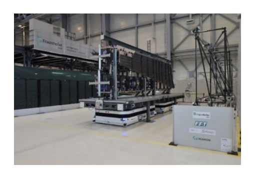
Figure 6 | Caption

Automated rudder hinge assembly in aircraft tail planes – Automated on-demand shim application to compensate component tolerances: a lightweight robot guides a rudder hinge under the dispensing system for liquid shim application.