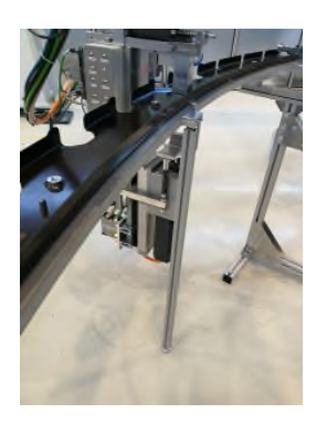
Figure 4 | Caption

Transfer of currently manually performed drilling processes at CFRP vertical tail planes to mobile Cobots.