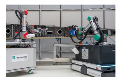
Figure 3 I Caption

Transfer of currently manually performed drilling processes at CFRP vertical tail planes to mobile Cobots.