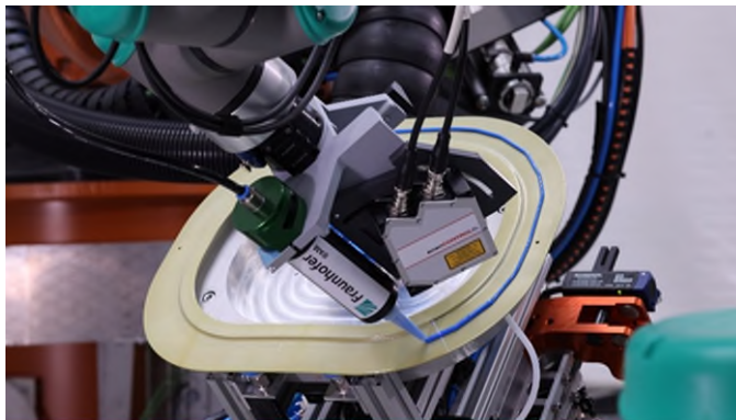
Figure 1 | Caption

© Fraunhofer IFAM, but can be published in reports about this press release. www.ifam.fraunhofer.de/en/Press_Releases/Downloads.html