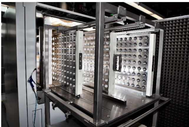
Low-pressure plasma system with easily exchangeable electrode systems, which also function as product carriers.