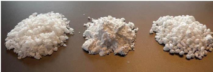
Picture 2: From PCL (left) to composite (right) containing bioactive glass (center).