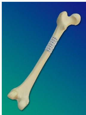
Picture 1: The SCABAEGO project scaffold can be customized to fit any size of long bone. With the help of a CT scan of the bone, the scaffold can be tailor-made using 3D printing.