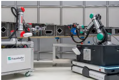
Figure 1 | Caption

Transfer of currently manually performed drilling processes at CFRP vertical tail planes to mobile Cobots.