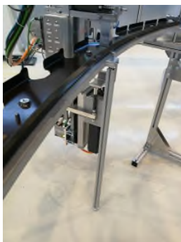
Figure 3 | Caption

Aircraft fuselage of the future: The Clean Sky 2 Multifunctional Fuselage Demonstrator (MFFD) in detail. It is currently being realized at Fraunhofer at the Research Center CFK NORD in Stade on a 1:1 scale with project partners.