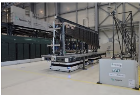
Figure 5 | Caption

Automated rudder hinge assembly in aircraft tail planes – Automated on-demand shim application to compensate component tolerances: a lightweight robot guides a rudder hinge under the dispensing system for liquid shim application.