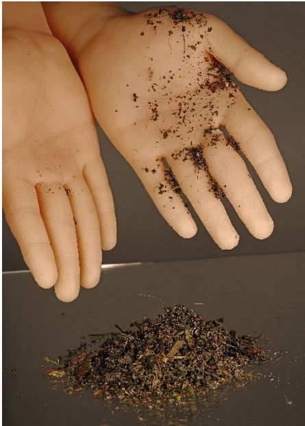
Fig. 2 Vacuum ultraviolet (VUV) modification of silicone surfaces is a possible substitute for gas-phase fluorination. The dirt-repelling, wear-resistant functional coating permits a wide range of applications in medical technology, from prostheses with an adjusted feel to dirt-repellent respiratory masks. The treated silicone hand (left) demonstrates how the coating prevents dirt particles from sticking to the surface.