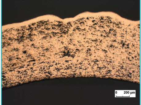
Fig. 2 Micrograph of a coated porous metal paper structure